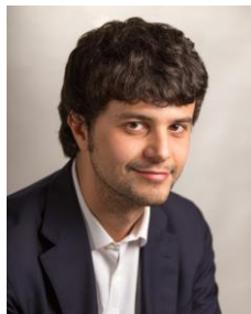
Mr Brando Benifei

Georgi Pirinski was elected a Member of the European Parliament in May 2014 (Group of the Progressive Alliance of Socialists and Democrats – S&D) and currently serves on the Budgetary Control and Employment and Social Affairs Committees. Previously, he was the President of the National Assembly of Bulgaria (2005–2009) and Vice-President of the National Assembly of Bulgaria (2009–2013). His career in national politics started in 1990, with his election to the 7th Grand National Assembly that adopted in July 1991 the new Bulgarian Constitution, marking the return to multi-party democracy. He has also served as Minister of Foreign Affairs (1995–1996) and Member of the National Assembly (1990-2013).