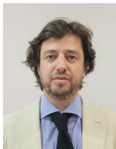
Prof. Miguel Poiars Maduro

Director of the School of Transnational Governance, European University Institute, Portugal