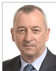
Mr Georgi Pirinski

Marianne Thyssen was also the party leader of the Flemish Christian-Democratic Party (CD&V) and the First Vice-President of the EPP Group in the European Parliament. She was elected Vice-President of the European People's Party in October 2015.