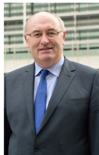
Mr Phil Hogan, European Commissioner for Agriculture and Rural Development

This must-attend conference follows the previous annual fi-compass conferences dedicated to EAFRD financial instruments that took place in Dublin (2015) and Brussels (2016) as well as a series of six macro-regional conferences that took place in Vienna (2015), Riga (2015), Madrid (2016), Rome (2016), Warsaw (2016) and Tallinn (2017).